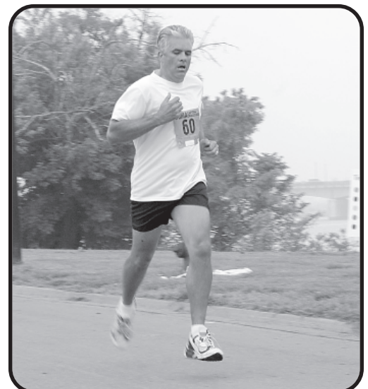
Senator John Ensign