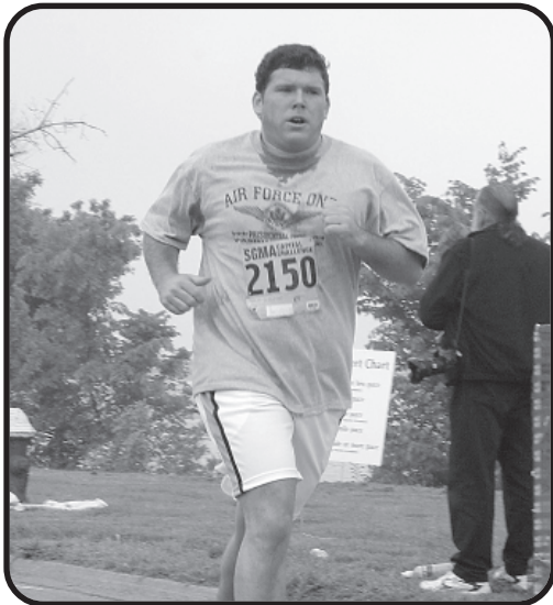
Bret Baier, Fox News