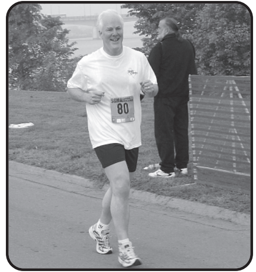
Senator John Cornyn