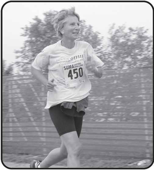
Representative Jane Harman