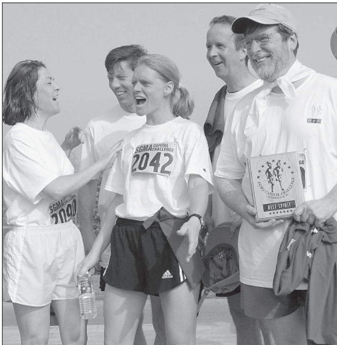
NPR Team - Best Spirit