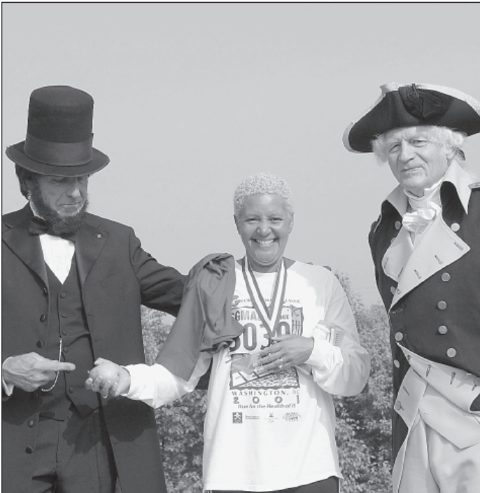
Judge Natalia Combs-Greene