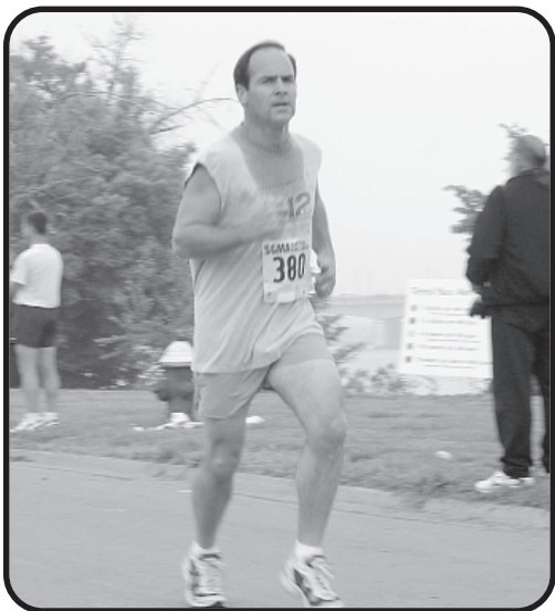
Representative Zach Wamp