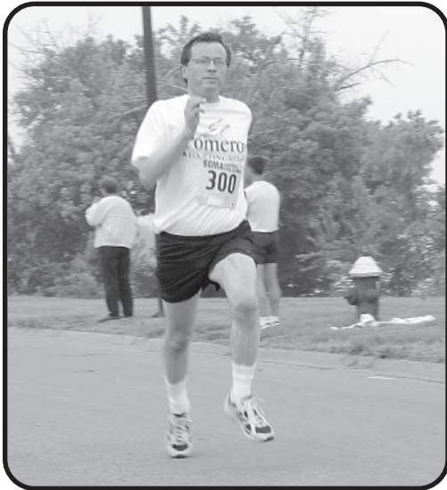
Representative Earl Pomeroy