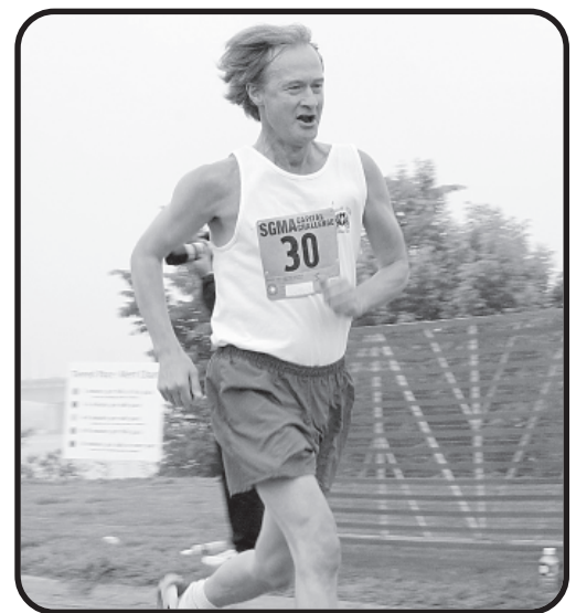
Senator Lincoln Chafee