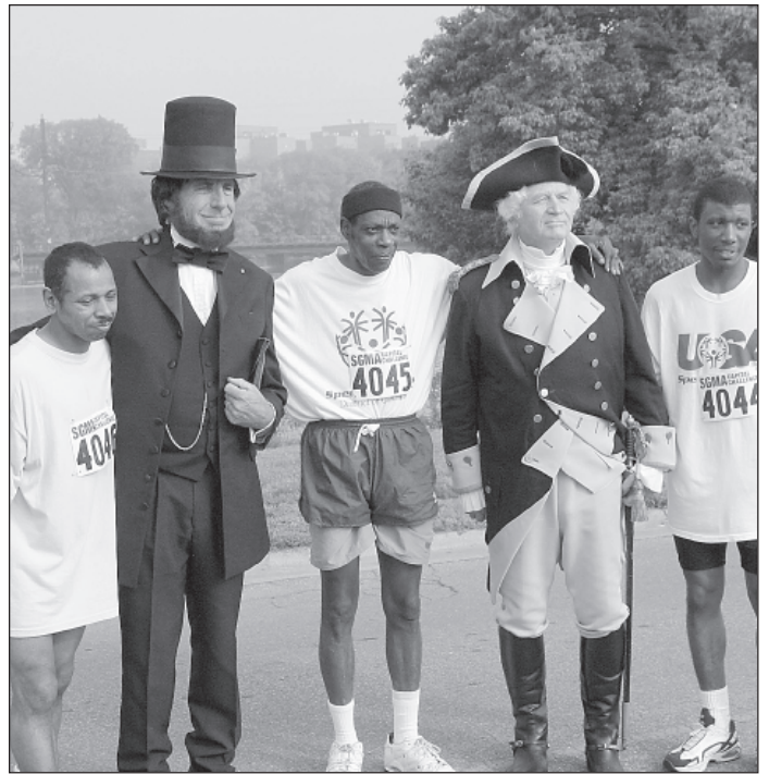
DC Special Olympians and Friends