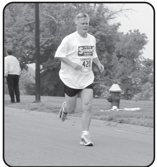
Representative Pete Sessions