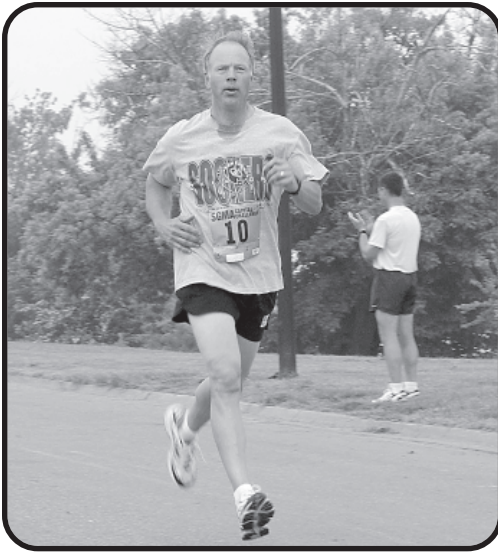
Senator Don Nickles