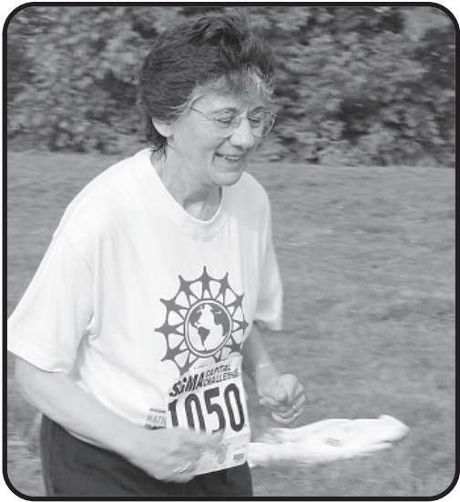
Rita Colwell, National Science Foundation Director