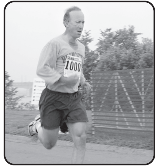
OMB Director, Mitch Daniels