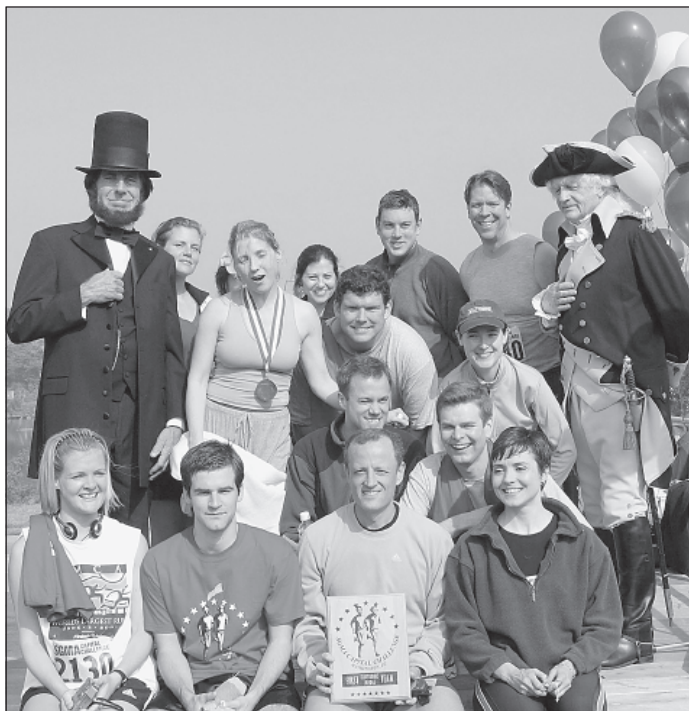
Fox News Team