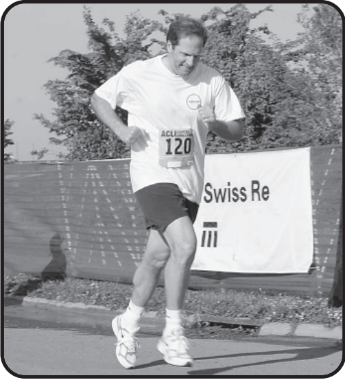
Fastest Man in Senate, John Sununu