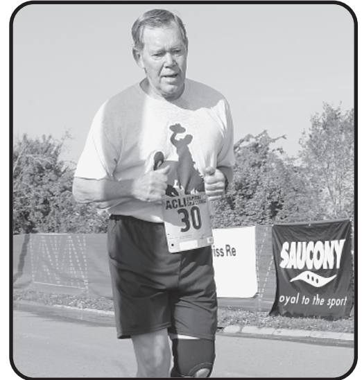
Senator Craig Thomas