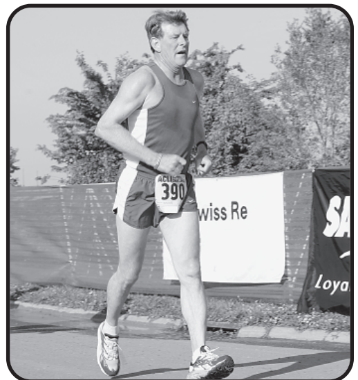
Representative CL "Butch" Otter