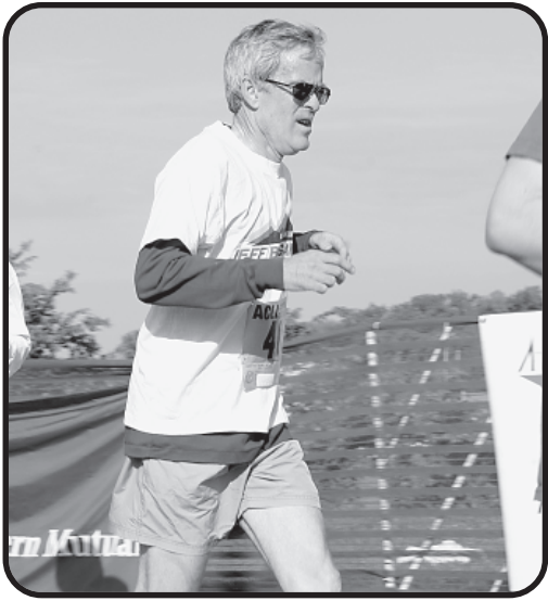
Senator Jeff Bingaman