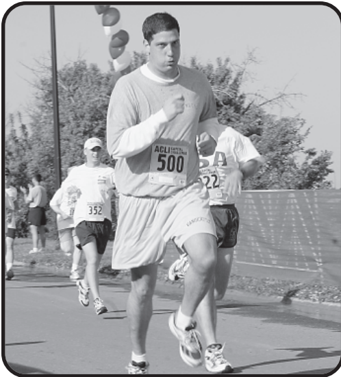
Representative Tim Ryan