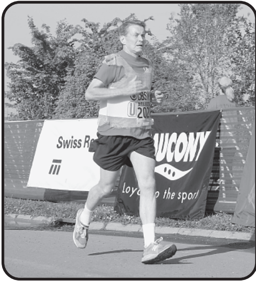
CBS's Bill Plante