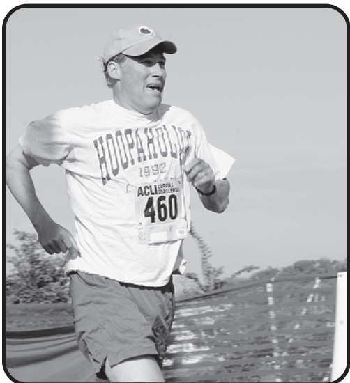
Representative Jay Inslee