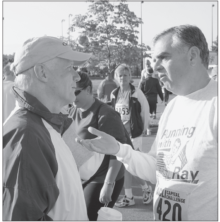
ACLI President Frank Keating and Representative Ray LaHood