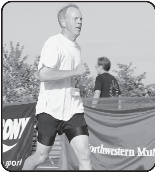
Senator Don Nickles