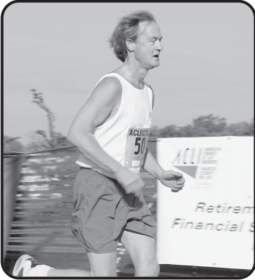
Senator Lincoln Chafee