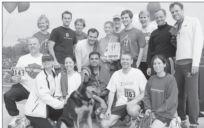
Fox News ("Our Bark is Worse than Our Bite")