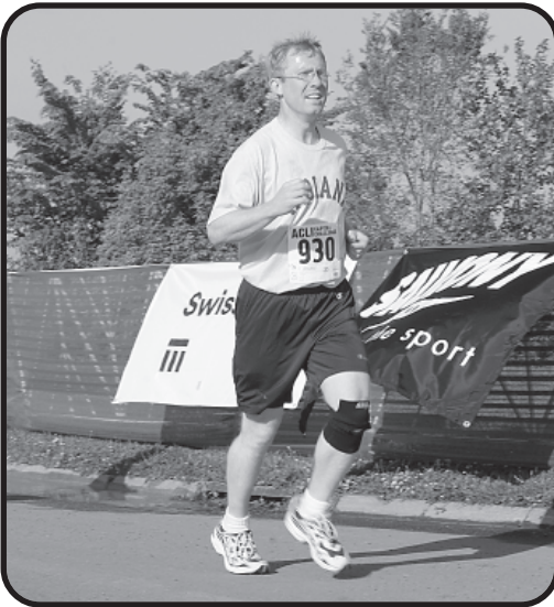
CFTC Commissioner Walt Lukken