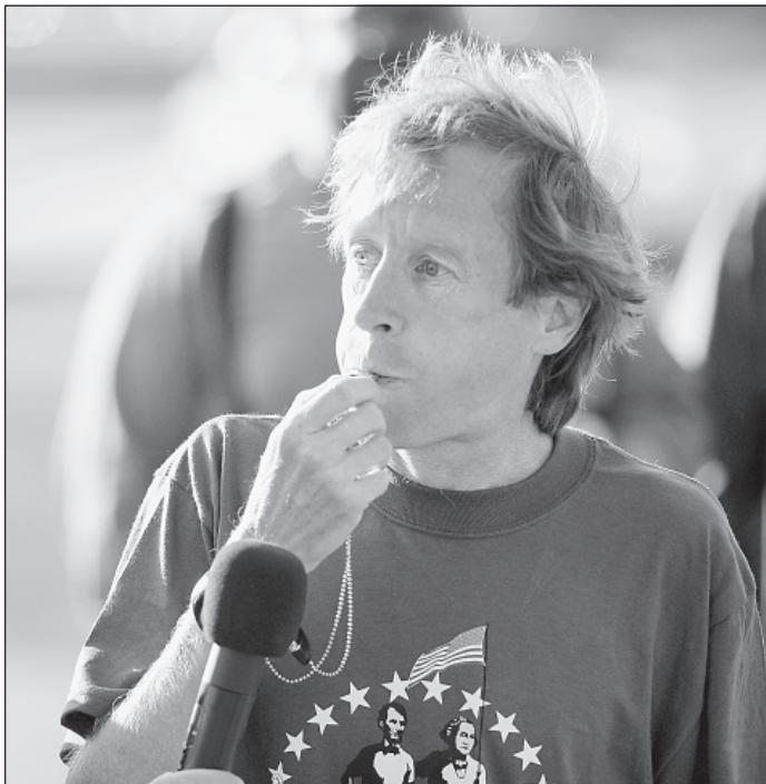
Official Whistle Blower