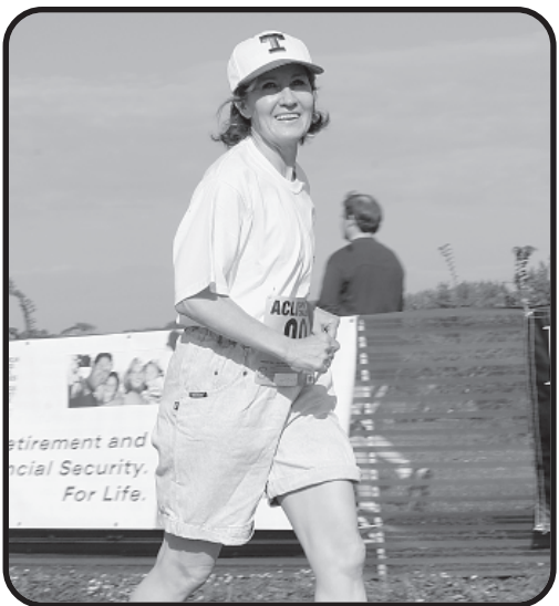
Senator Kay Bailey Hutchison