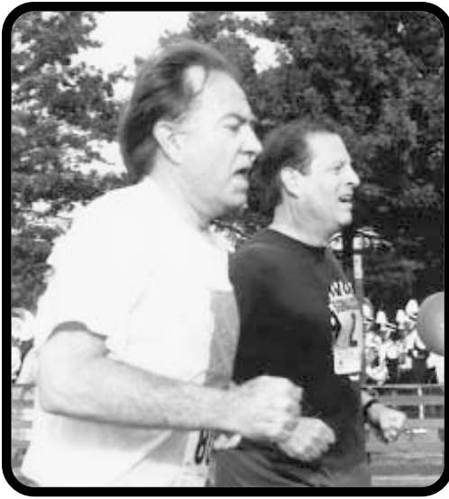
Vice President Al Gore