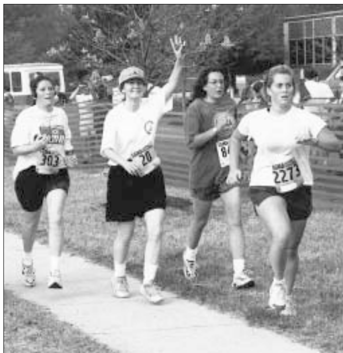
Senator Kay Bailey Hutchison (R-TX), #20 happily heads for finish as 1 st female Senator.