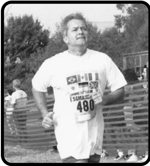
Rep. Mark Foley (R-FL)