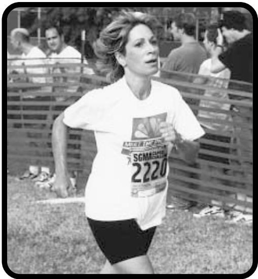
NBC's Andrea Mitchell