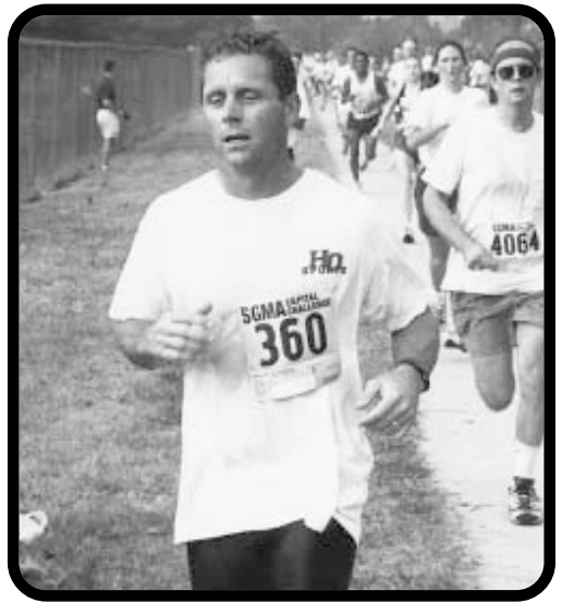
Rep. Steve Largent (R-OK)