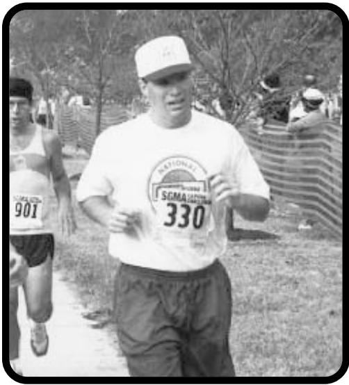
Rep. Tim Holden (D-PA)