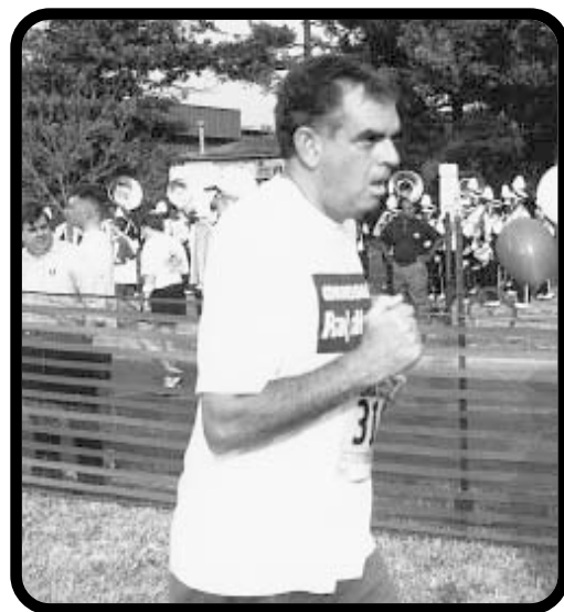
Rep. Ray LaHood (R-IL)