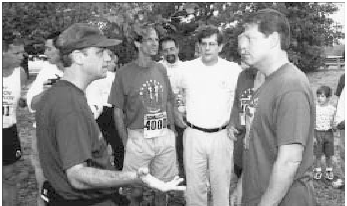
"My training is increasing but my times won't come down!" Rep. Blumenauer seeks counsel from Vice President Gore.