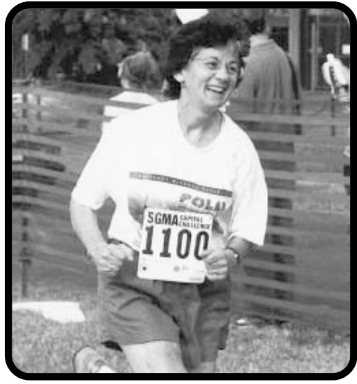
Rita Colwell, National Science Foundation Director and 1 st Independent Agency Head (Female)