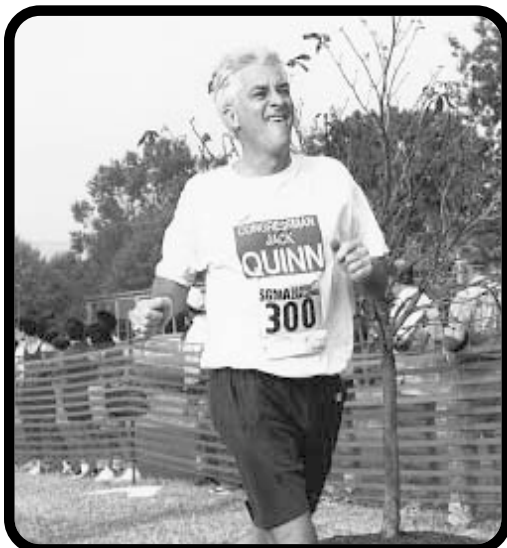
Rep. Jack Quinn (R-NY) heads for the finish.